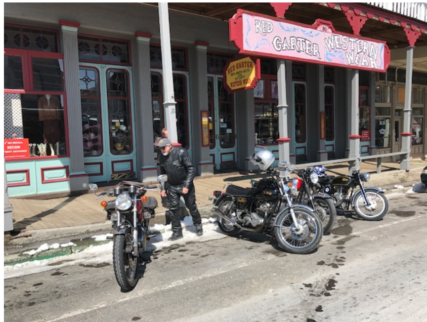
100/100/100 Virginia City Stop